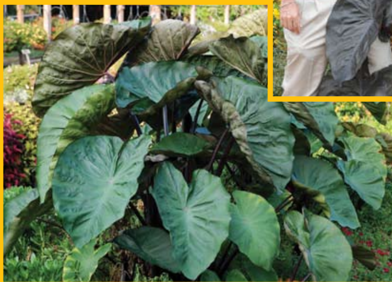
HILO BAY AT UNIV OF GEORGIA-ATHENS GARDENS